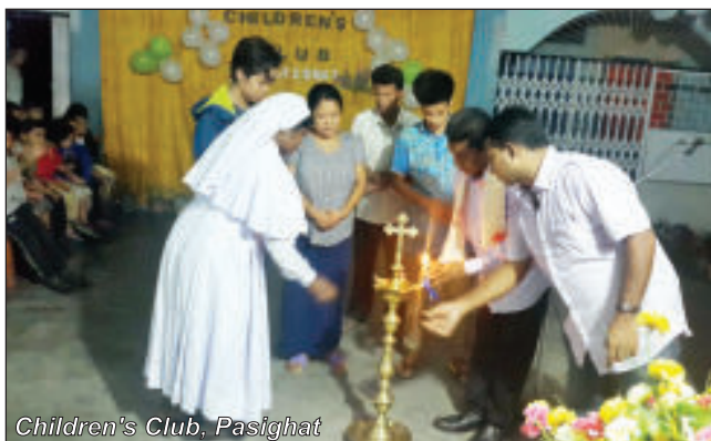
Children's Club, Pasighat