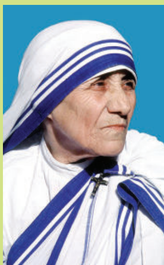
St. Teresa of Kolkata