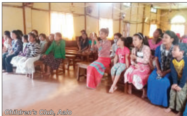
Children's Club, Aalo

Children's Clubs were inaugurated in Pasighat, Aalo, Basar, Yingkiong, Kaying and Tato. The objective of having Children's Club in these places is to provide better opportunities for the needy children of these areas, which are secluded from the mainstream due to its difficult terrain with poor road conditions and lack of proper communication system. As a consequence it makes almost impossible to reach the place and people. Children's Club would provide the much needed opportunity for personal development of the children and young people of these places through various activities and events. The active participation of the children and the constant guidance of the coordinators and local directors of each respective centre prepare the children for a better future. As a result, children are empowered and their creative capacities promoted paving a way for their inclusion in the mainstream and enabling them to contribute to positive changes in their communities.